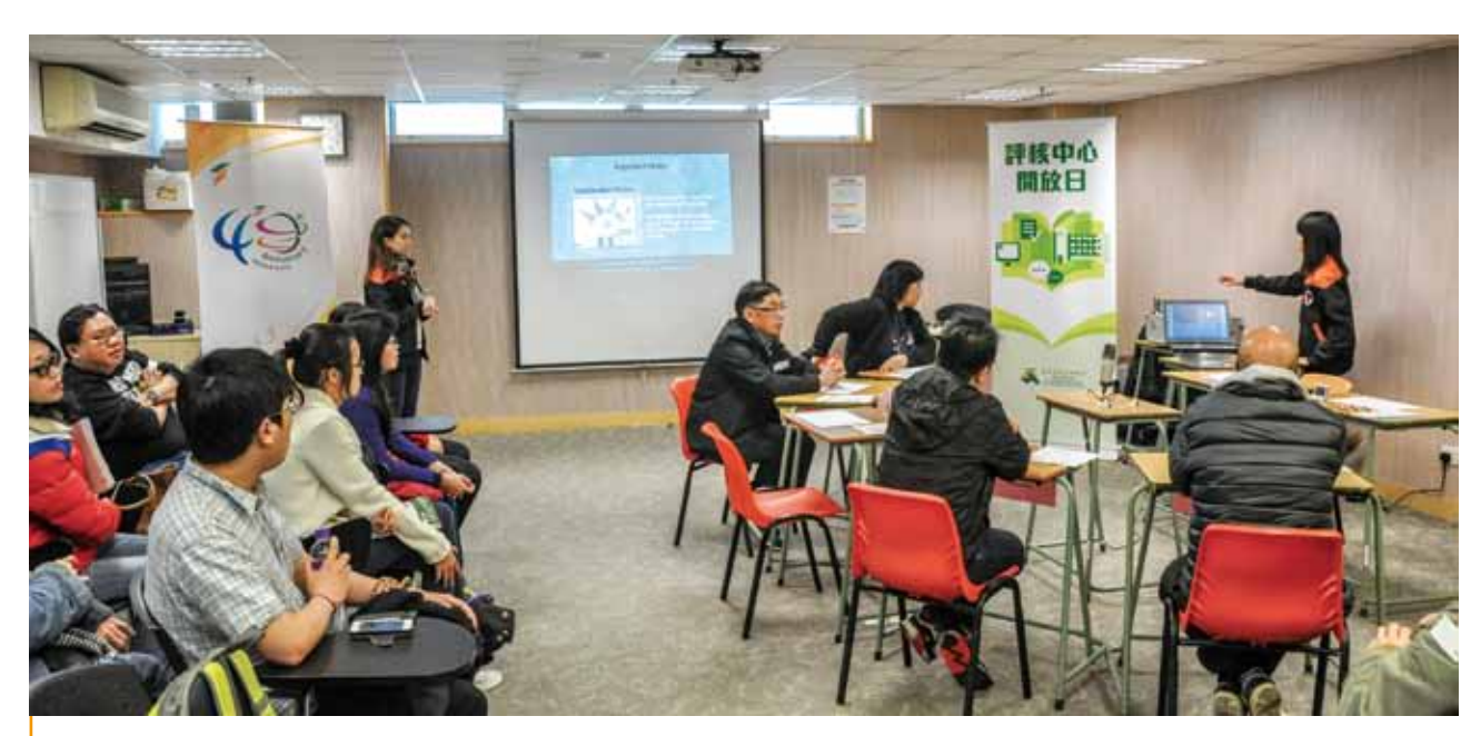
學生及家長於荔景評核中心開放日,參加口試錄影系統模擬測試,了解口試運作 During the Lai King Assessment Centre Open Day, students and parents took part in the mock up testing of the Oral Recording System used in speaking tests

我們於2017年1月份舉辦了一年一度的開放 日及一系列文憑試資訊講座,吸引約一千名 公眾人士、學生及家長參與。各科目經理向 參加者分享有用的資訊及講解文憑試的應試 準備要點,並解答公開考試的常見問題,如 公開考試的閱卷與評級。